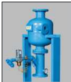
BOILER BLOWDOWN SYSTEMS