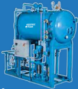
Jet Spray .005 cc/Liter Spray Type Pressurized Deaerators