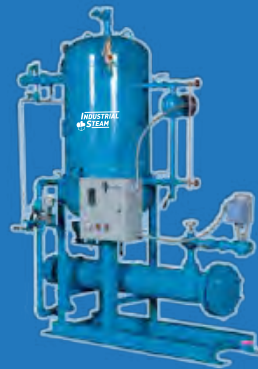
Blowdown Heat Recovery Systems, Blowdown Separators

Have questions or need help specifying this equipment? Email: engineering@industrialsteam.com