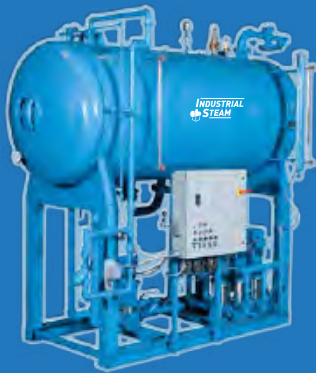
Steam Flow .005 cc/Liter Pressurized Recycling Deaerators