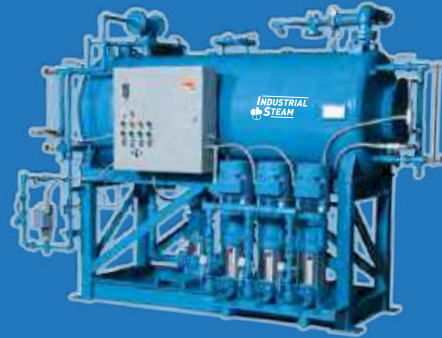
Spray Flow II .005 cc/Liter Atmospheric Recycling Deaerators