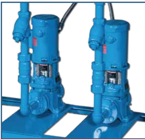
Close up of two boiler feed pumps installed on the 100 FS Compact Boiler Feedwater System